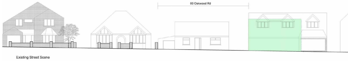
Existing Street Scene