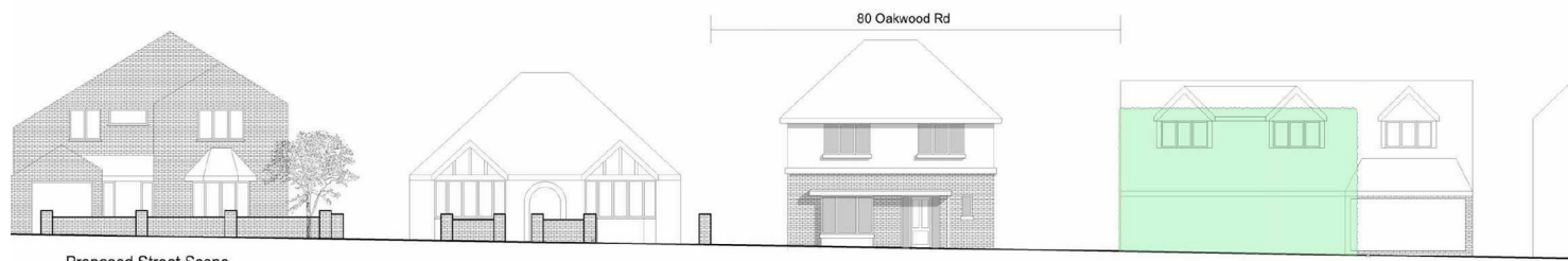
Proposed Street Scene